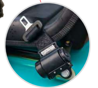
Safety seat belt