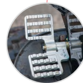
Aluminum pedal control